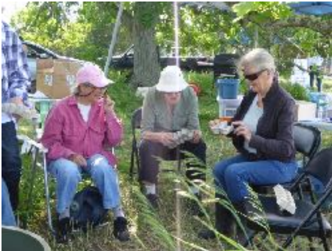
Studying moths in egg cartons.