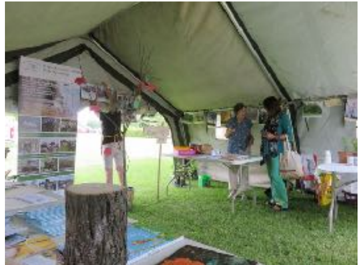
Hanging up the tree photos.

Tree the County is also planning a showing of Call Of the Forest on September 28th at St Andrews.