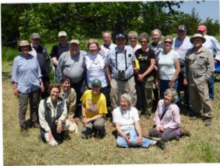
The BioBlitz team.

The weather was great! Chucky (Chuck-will's-widow) was there on cue. Everything was perfect for our fourth BioBlitz last June 10-11th. With the Miller Family Nature Reserve as our study area, we were ready to document the plants and animals of this Hastings-Prince Edward Land Trust property. The property is just a little to the west of the Ostrander Point Crown Land Block, along the south shore of the county and within the PEC South Shore Important Bird and Biodiversity Area.