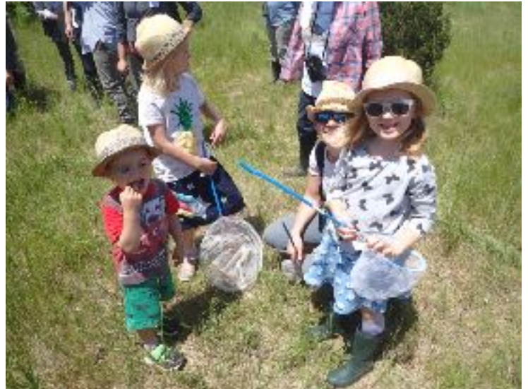
Children with butterfly nets.

There were so many exciting moments, Les' discovery of fish in the freshwater pond, to Tom Mason's Black Widow Spider discoveries, to listening to the Nighthawks, Whip-poor-wills and Chuck-wills-widow calling on Saturday evening. More excitement was experienced during the day when a