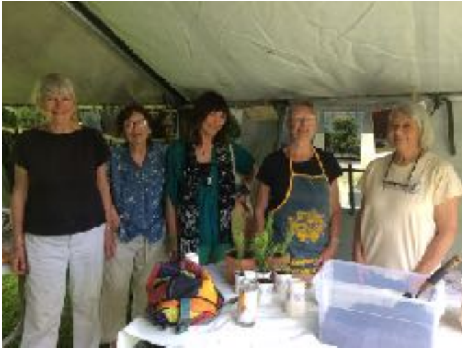
At the tree planting table.