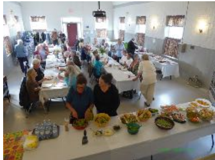
Potluck celebration.