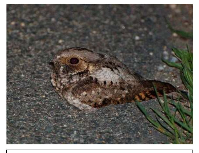
The eastern whip-poor nests both in the IBA and at Johnston Point. <u>https://www.allaboutbirds.org</u>

http://naturestuff.net/site/index.php?option=com_content&task=view&id=1665&Itemid=28