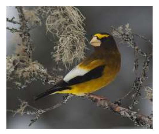
The Quinte Naturalist November, 2017 – Page 6