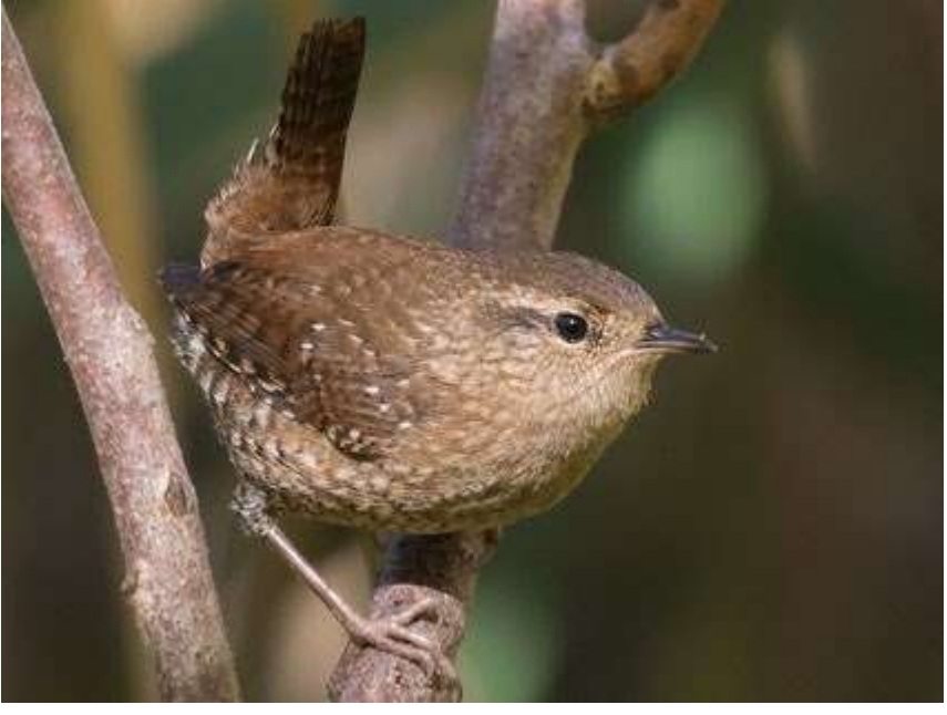
The winter wren is a tiny bird, smaller even than its cousin the house wren. Its small size, colour and behavior make it hard to spot. In fact, if you do see one you may mistake it for a mouse. It scurries around under tangles of fallen trees and branches foraging for spiders and insects. Any attempt to remain anonymous ends in the spring and summer when the males sing. It's hard to believe that such a small bird can produce such a long intricate song. One author says that the male sings "with remarkable vehemence." The species is not common in this area and is seldom seen in the winter. Click this link for more information, a recording and a video. <u>https://www.allaboutbirds.org/guide/Winter_Wren/id</u>

Undoubtedly most QFN members need no introduction to the H.R. Frink Education Centre. Its variety of habitats from an upland beech-maplehemlock forest to a silver maple swamp to a marsh plus others just offers too many opportunities to experience nature to ignore. My choice for this walk was the site of this earlier incident along the Drumlin Trail.