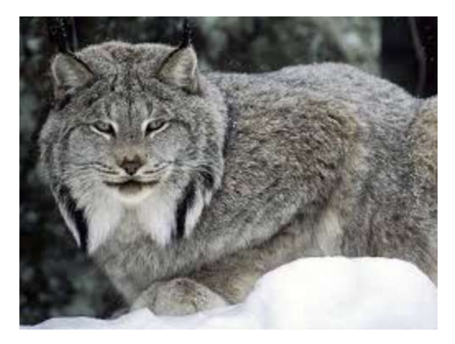
Bobcat or Lynx? Mon., Nov. 27. 7:00 p.m. Sills Auditorium, Bridge St. United Church