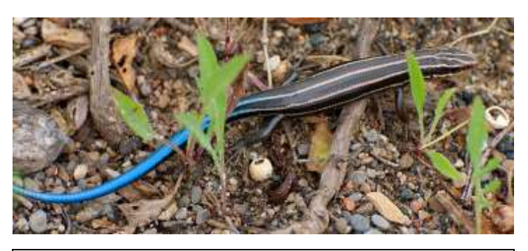
The five-lined skink, Ontario's only lizard, which is "protected" by the Endangered Species Act occurs at Johnston Point.