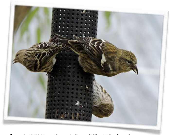
female White-winged Crossbill at Sydney's feeder

“The Evening Grosbeaks appearing at bird feeders this fall are one of Canada’s declining species. It has declined 78% in the last 40 years. Other examples of species decline: our iconic Canada Warbler: 80%; Rusty Blackbird: 90%; Olive-sided Flycatcher 79%; Bay-breasted Warbler 70%. And in September the World Wildlife Fund reported that animal populations have fallen on average by 52 percent since 1970. The findings pertain mostly to vertebrate species, including mammals, birds, fish, amphibians and reptiles.