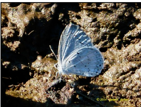
Summer Azure ( Celastrina neglecta )

While the Blanding's turtles were well concealed in cool mud, Monarch and Giant Swallowtail butterflies were making good use of the wild flower meadows. Several Monarch caterpillars were found on the plentiful milkweed. An exciting new discovery for Ostrander Point was the Harvester Butterfly, the caterpillars of which feed only on a particular group of plant lice, which in turn feed only on a few kinds of woody shrubs in swamps. It is our only carnivorous butterfly. This remarkable, rare and local insect is not only new for Ostrander Point; it is also the first and only record for PEC, again establishing the biodiversity value of Ostrander. Also documented was the rare Appalachian Brown Butterfly also an inhabitant of swamps. Butterflies were making good use of the wild flower meadows. Several Monarch caterpillars were found on the plentiful milkweed. An exciting new discovery for Ostrander Point was the Harvester Butterfly, the caterpillars of which feed only on a particular group of plant lice, which in turn feed only on a few kinds of woody shrubs in swamps. It is our only carnivorous butterfly. This remarkable, rare and local insect is not only new for Ostrander Point; it is also the first and only record for PEC, again establishing the biodiversity value of Ostrander. Also documented was the rare Appalachian Brown Butterfly also an inhabitant of swamps.