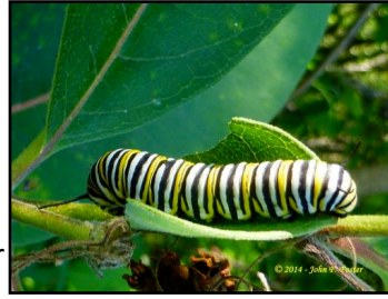
Monarch caterpillar ( Danaus plexippus )