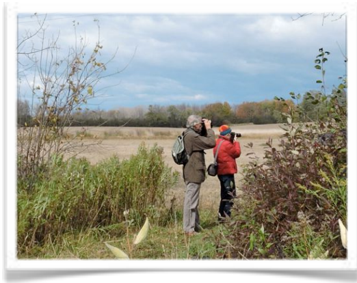
Millennium Trail outing Oct. 9