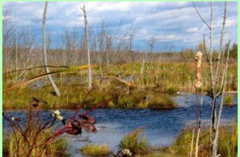
Millennium Trail Oct 9/14

Today we walked along the Millennium Trail to explore an extensive wetland north of Danforth Road. We spotted a pair of mallards in the water and behind them mostly hidden by rushes, a heavy orange beak and partial white head of a bird we could not see clearly enough to identify. Further along the trail we saw a kingfisher perched on a dead tree trunk but it flew off before some of us had our binoculars aimed. We saw a Northern Harrier, easily identified by the white patch on its rump. Across the trail flew a blue jay and later a robin. The grey dogwood was heavy with ripe berries beside the path and occasionally we caught sight of bright orange bittersweet berries. On our way back Sheila pointed out a Shaggy Mane fungus broken on the footpath and nearby we saw a clouded sulphur butterfly. We caught sight of a Monarch Butterfly and talked about the increase in Monarch sightings this year over last. There were some turkey vultures hovering in the sky and a black crow flew overhead. We noticed evidence of turtle nests, raccoons and beaver activity. Amy Bodman