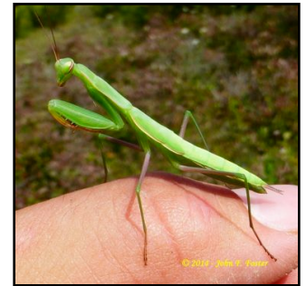
European Mantid ( Mantis religiosa );