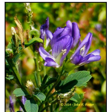
Alfalfa ( Medicago sativa L. ssp. sativa )